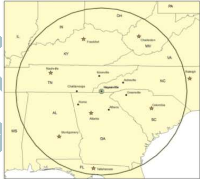
Map 2: Clay County , Relation to Other Metro Areas and State Capitals