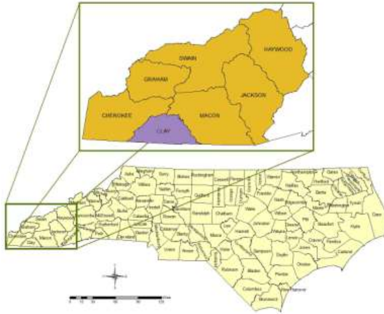
Map 1: Clay County – Position in North Carolina and Region